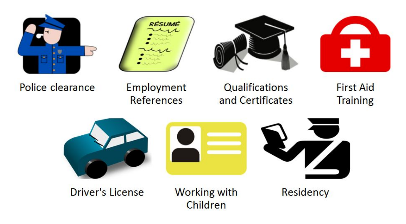
Figure 1: Identified Components for Inclusion in a Skills Passport